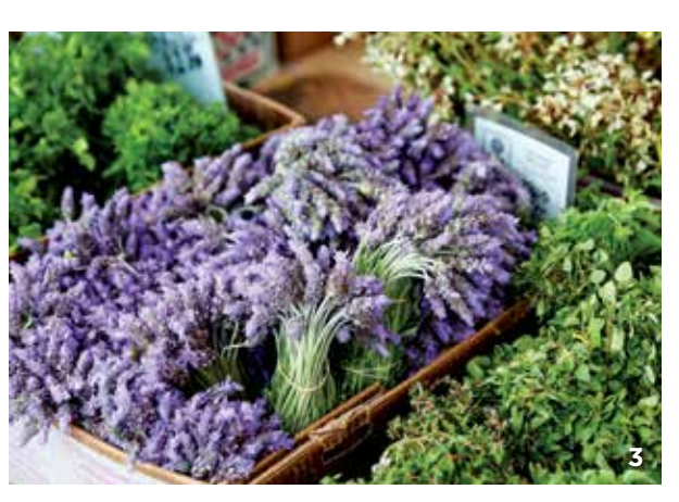
1. Lotusland 2. & 3. Santa Barbara Farmers' Market