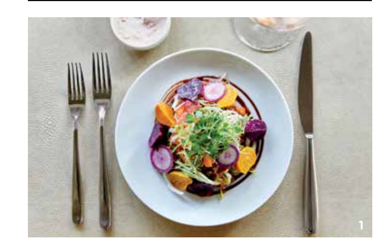
1. Olivers 2. Belmond El Encanto

On the Alley Relaxed and family friendly, try this popular salty-dog fave located near the Santa Barbara Harbor. Kids go nuts for the waffle fingers and burritos with tater tots, and parents can opt for a chopped sesame salmon salad or clam chowder. Sit outside to watch the gently bobbing boats. 117 Harbor Way, onthealley.com