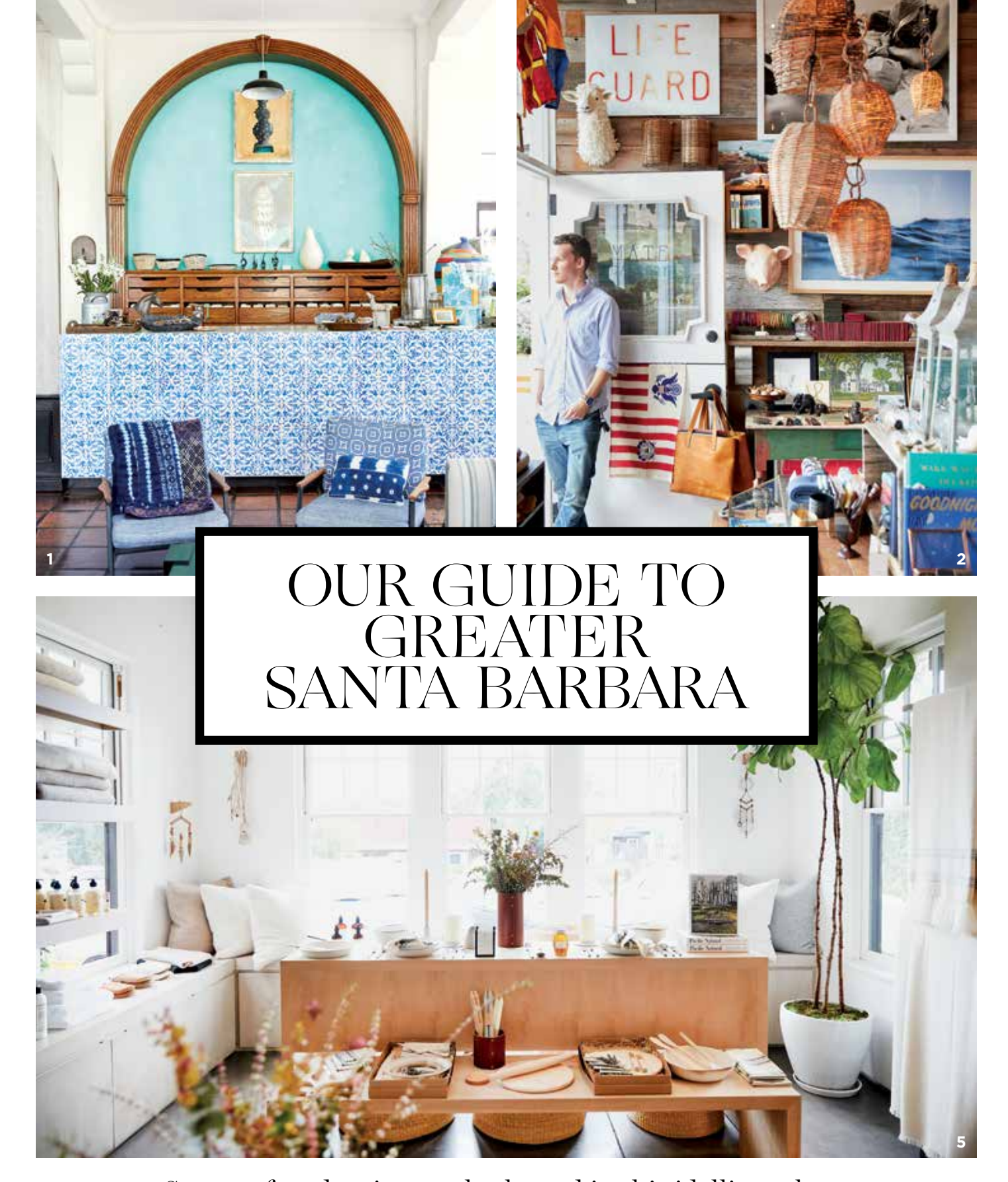
Sun, surf, and serious style abound in this idyllic enclave. Read on for the best of the California coastal town (often called the American Riviera) and surrounding area.