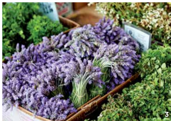
1. Lotusland 2. & 3. Santa Barbara Farmers' Market